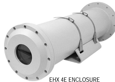
EHX 4E ENCLOSURE