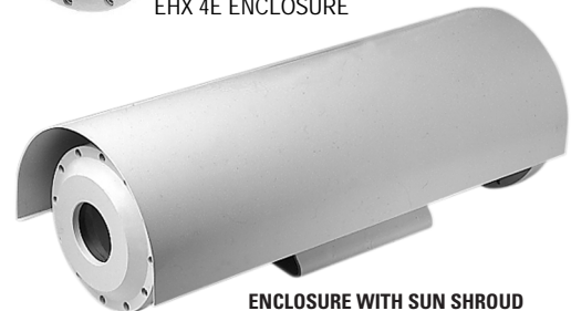
ENCLOSURE WITH SUN SHROUD

The EXEHX4E explosionproof camera enclosures are used in explosive and hazardous atmospheres throughout the world. They are designed to meet the rigorous requirements of explosionproof and dust-ignitionproof electrical equipment for installation and use in hazardous locations. These enclosures are also waterproof and dust tight.