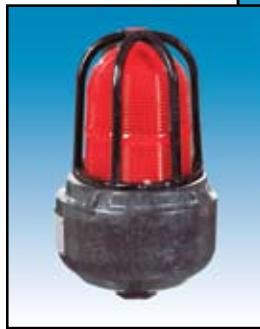
XB15 Pipe Mount Note: UL only (with cast guard)