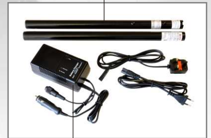
Solo 725 Fast Charger