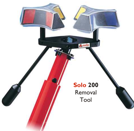
Solo 200 Removal Tool