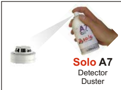
Solo A7 Detector Duster